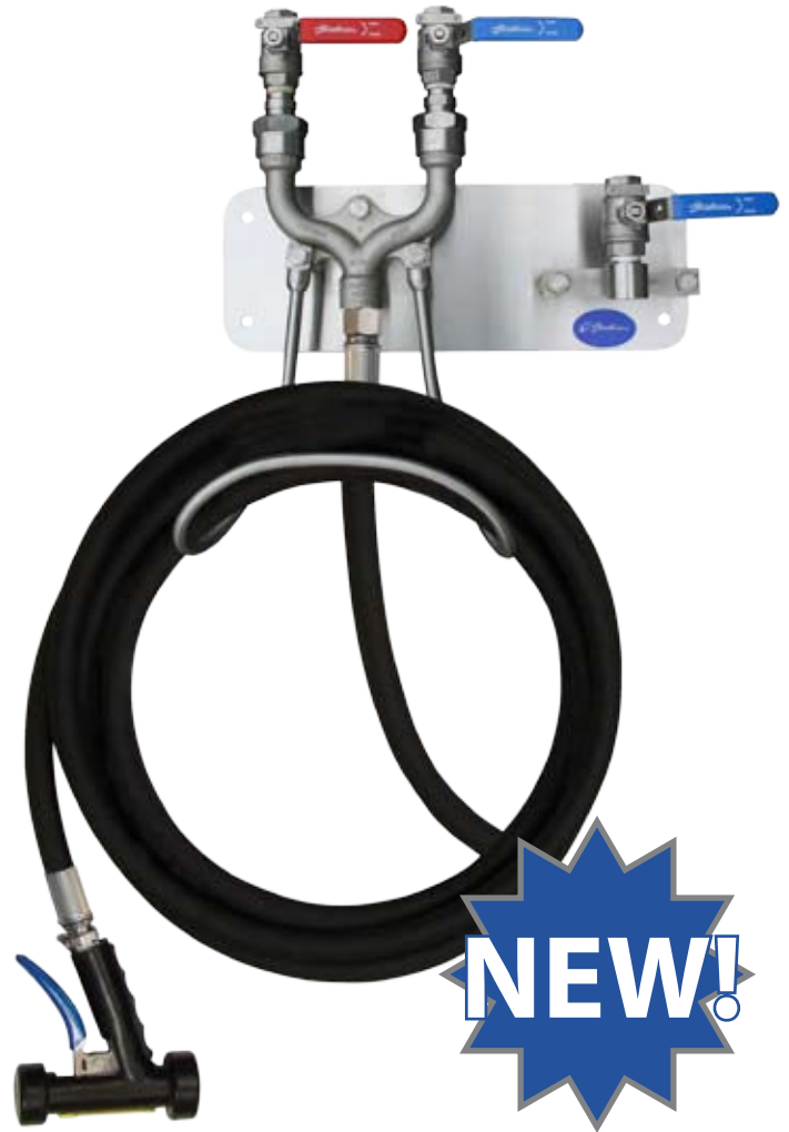
Shown: M-750 with ball valves; shown with premium hose assembly and S-70 Series nozzle.