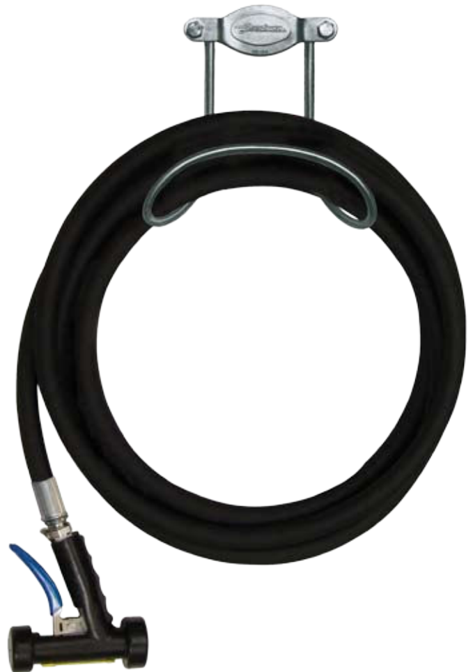
Shown: HR-100 Wall-Mounted Hose Rack; shown with premium hose assembly and S-70 Series nozzle.

Using \frac{5}{8} " Masonry Drill, drill two holes on a horizontal line made deep enough to admit the Loxin Shields. Insert Shields with nut end to back of hole and tighten screw until rack is securely fastened to wall.