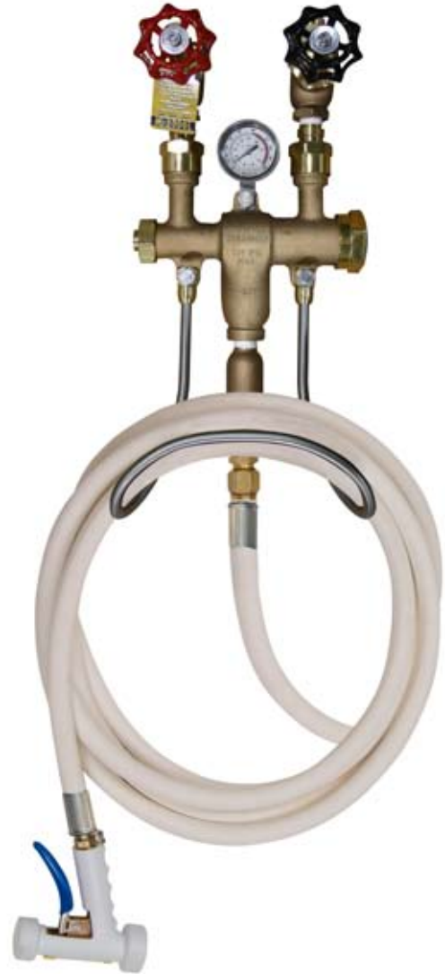
Shown: M-5000TG, bronze; shown with premium hose assembly and M-70 Series nozzle Available: M-5700TG, stainless steel