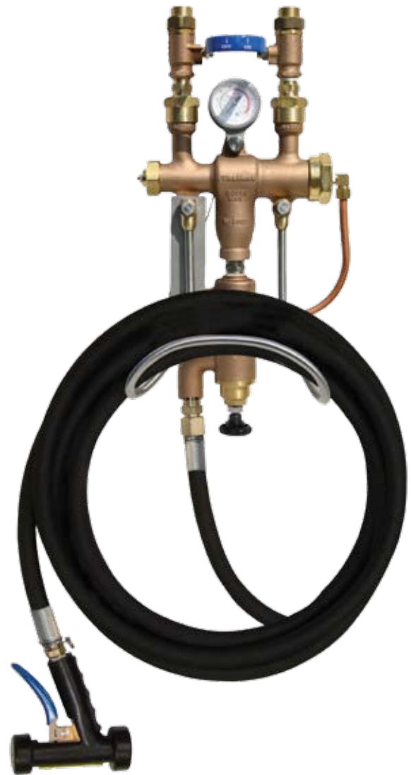
Shown: Bronze M-5000TS ; shown with premium hose assembly and M-70 Series nozzle

Please see reverse side for parts listing.