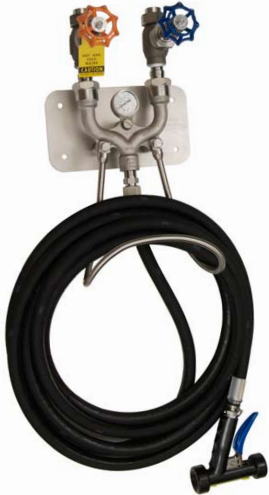
Shown: Stainless steel M-750TG with globe valves; shown with premium hose assembly and S-70 Series nozzle Available: Standard M-750 , bronze M-159 and M-159TG

Please see reverse side for parts listing.