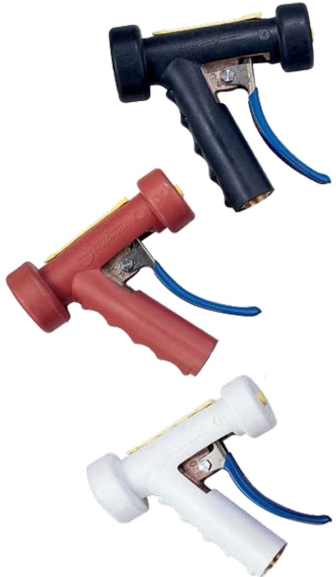
Shown: Red M-70 (black cover), M-75 (white cover), M-77 (red cover)

Please see reverse side for parts listing.