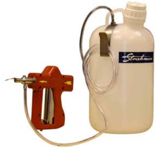
Shown: 2 gallon container attachment