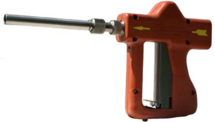
Shown: Red Hydro-Pro 150 with extension

The Hydro-Pro 150QC® spray nozzle is specially designed to accept any of the Quick Connect attachments with a simple ¼ turn to connect and disconnect for safe and convenient cleaning! Same great performance as the original Hydro-Pro 150 Spray Nozzle.