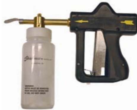
Shown: Black Hydro-Pro 150 with 16 oz. bottle